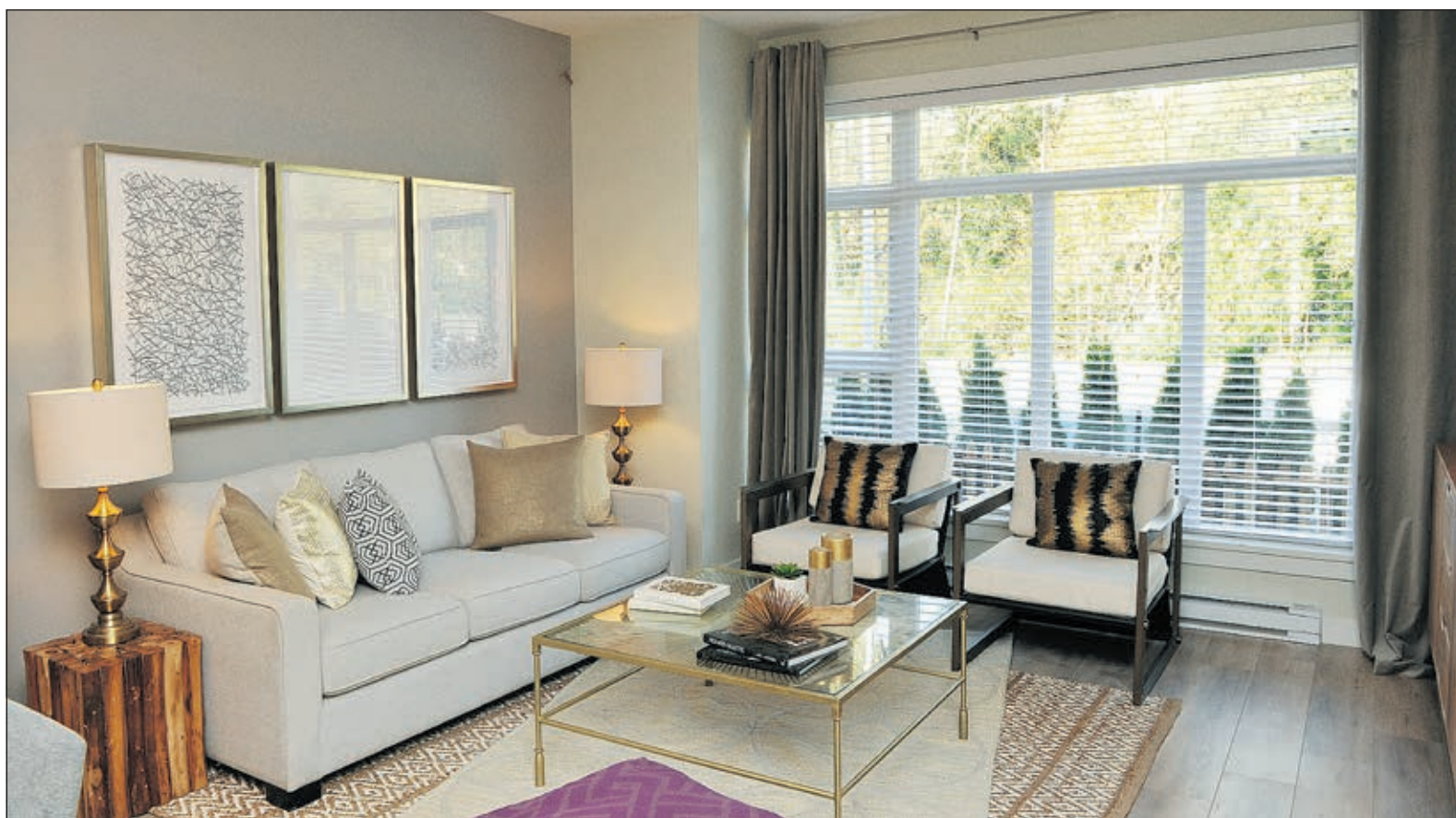
The main living area features neutral-coloured furniture paired with accents in the pillows and light fixtures.

For many, a fresh start can be as intimidating as it is exciting. Those who find themselves downsizing from a larger older home to a new smaller suite may find the shift requires a change in mindset and expectations. At the same time, a new environment can inspire creativity and an escape from the accustomed comfort zone.