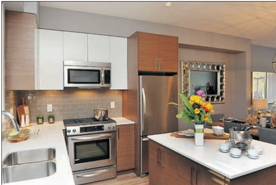
Kitchens are fitted with a premium KitchenAid appliance package.