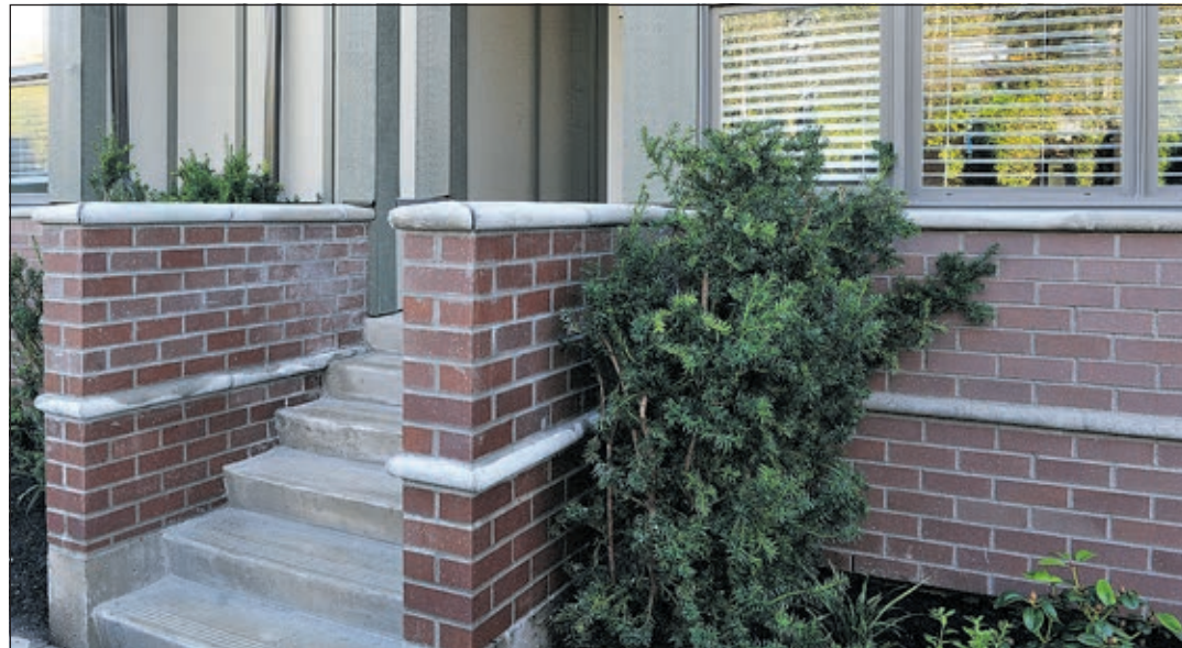
Red brick detail gives the Loden Green entrances a rich, sophisticated look.